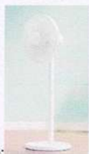
Immagine a colori del prodotto: